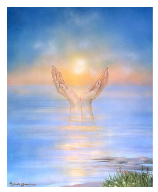
BY RALPH WALDO TRINE

NEW YORK DODGE PUBLISHING COMPANY EIGHTH AVENUE 33d Street 34th Street Copyright, 1917 BY RALPH WALDO TRINE